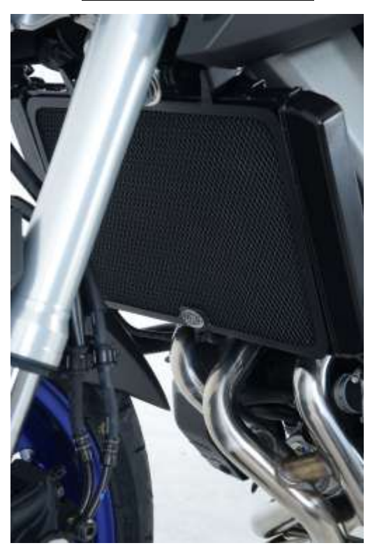
Le kit doit contenir : 1x Grille de protection (RAD0159BK) 1x S0722 Entretoise 1x Boulon M6x 35mm 1x M6 Rondelle 1x Collier de serrage 2x 100mm Longueurs de mousse autocollante