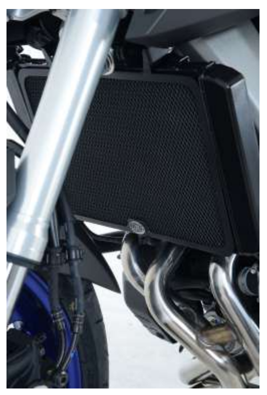
In This Kit There Should Be 1x Radiator Guard (RAD0159BK) 1x S0722 Spacer 1x M6x 35mm Long Button Head Bolt 1x M6 Washer 1x Cable Tie 2x 100mm Lengths of self-adhesive Foam